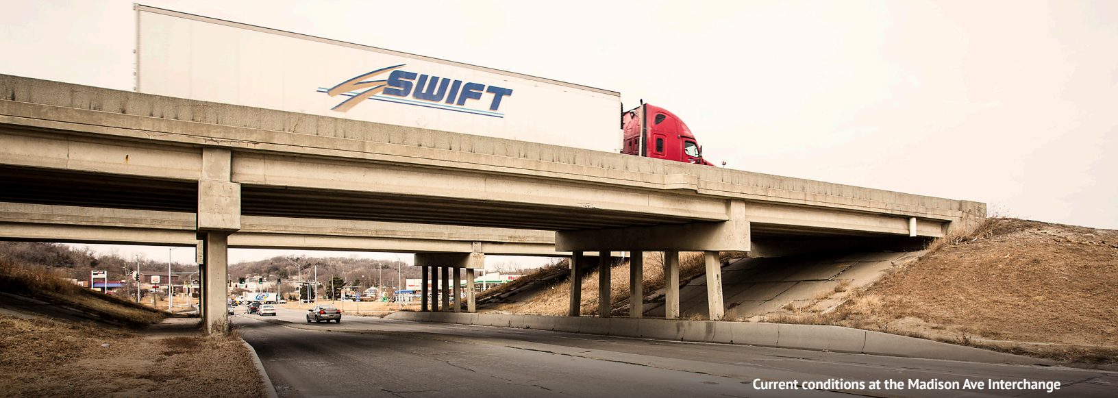
Current conditions at the Madison Ave Interchange