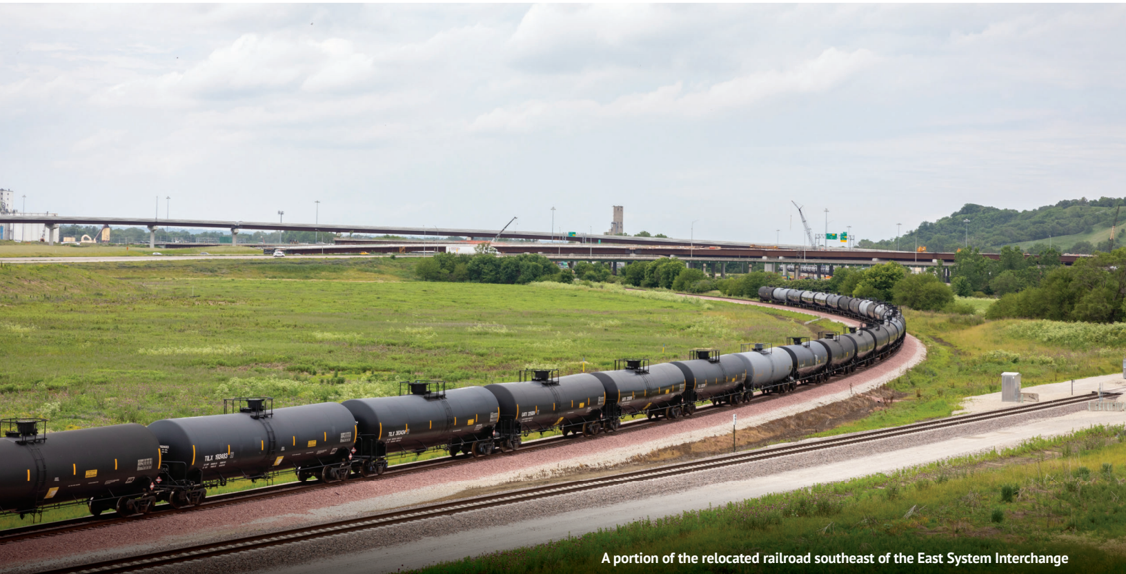
A portion of the relocated railroad southeast of the East System Interchange