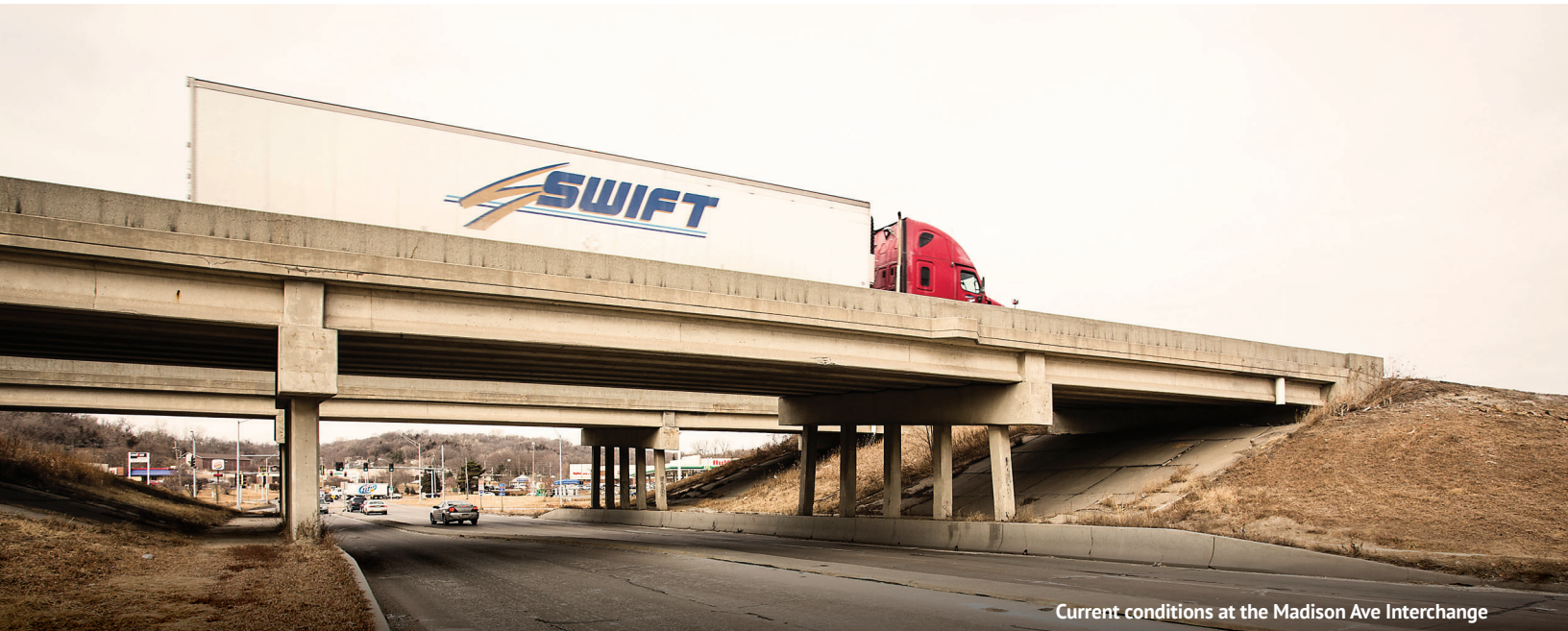
Current conditions at the Madison Ave Interchange