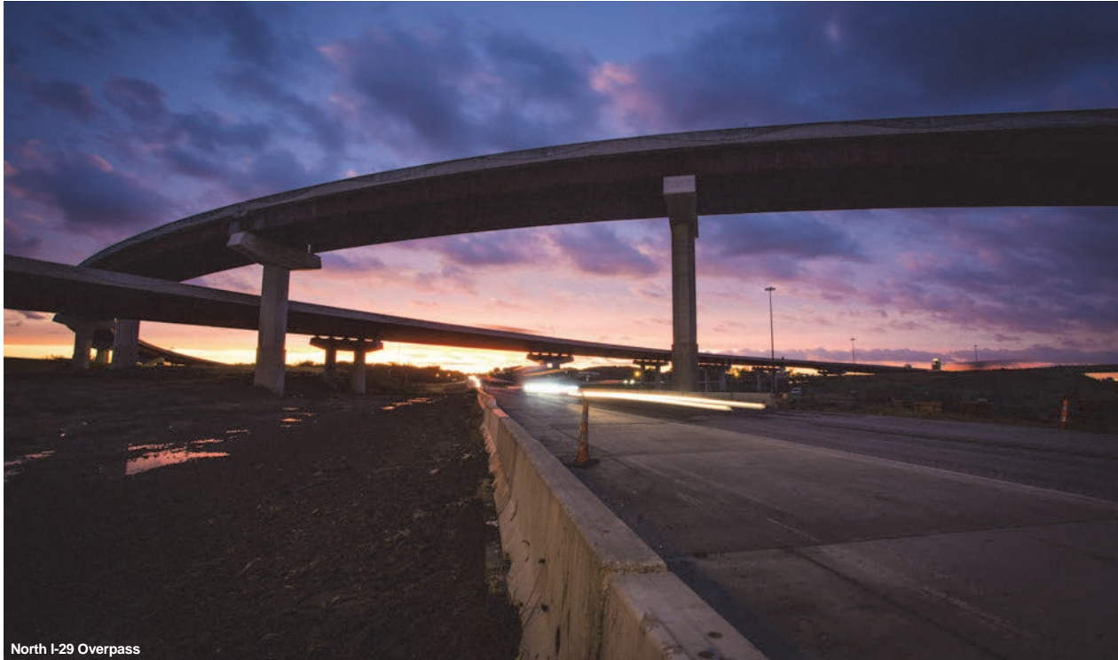
North I-29 Overpass